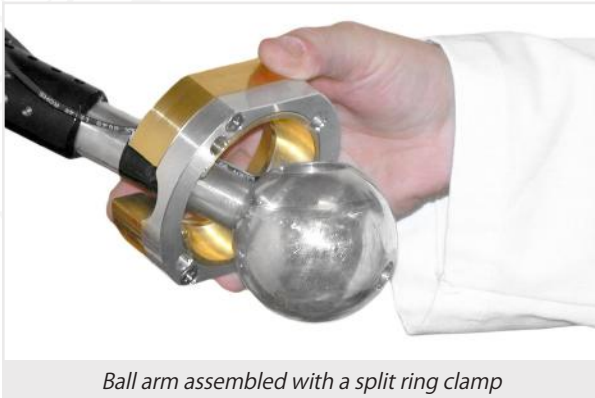
Ball arm assembled with a split ring clamp