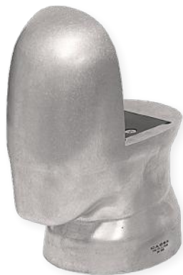
BACK SIDE CUT-OUT (100_04_HFAB)