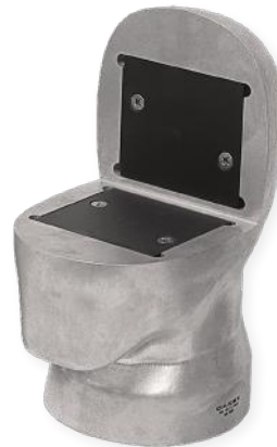
FRONT SIDE CUT-OUT (100_04_HFAF)