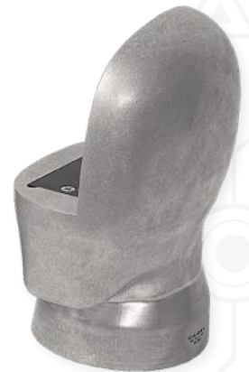
RIGHT SIDE CUT-OUT (100_04_HFAR)