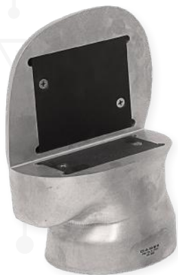
LEFT SIDE CUT-OUT (100_04_HFAL)