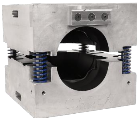
Cadex ballistic mold with handle, around 0.003 in of a gap. Available separately - P/N: 300_08_CBHMC