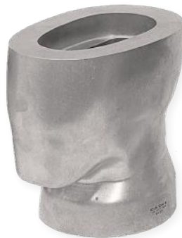
HALF HEAD CUT-OUT WITH INSERT (100_04_HFAH)