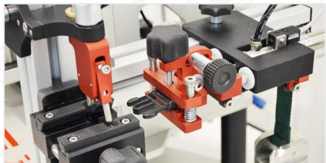
Durability of quick release system