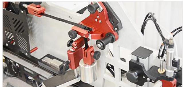
Resistance to abrasion test