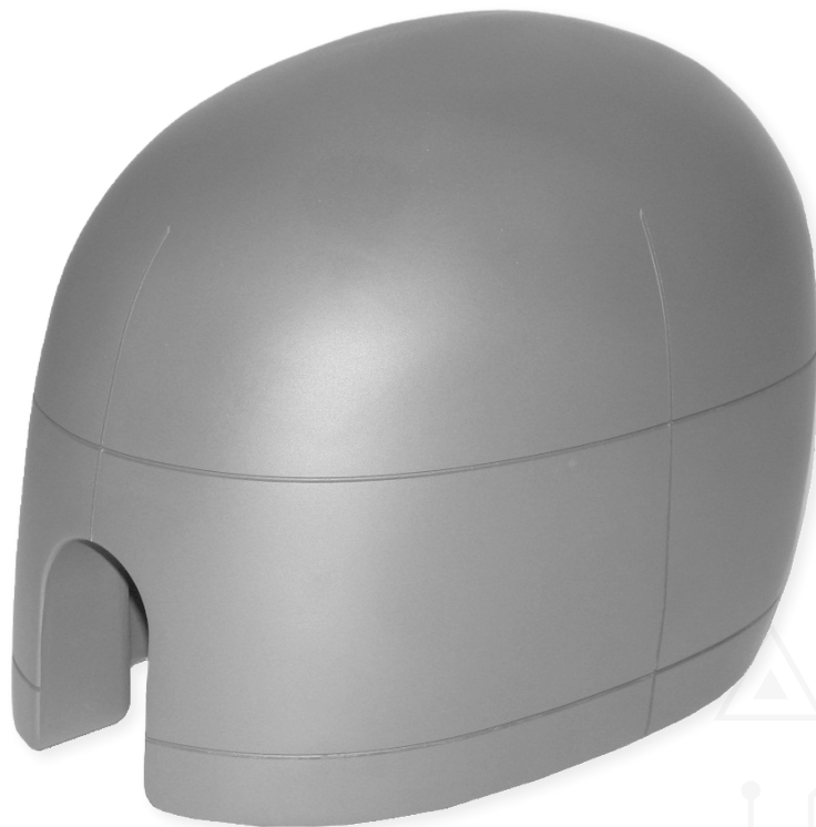
ANSI Z90.1 headform with the ear cup region also available