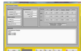
Cadex software included (to be installed on your computer)