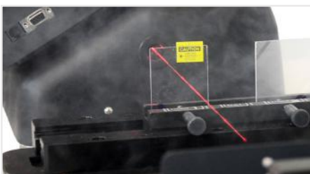
Laser beam (test must be performed in a dark room)