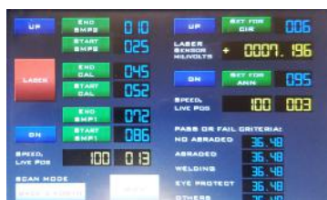
Touchscreen controller for acquisition and calculation