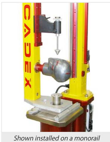
Shown installed on a monorail