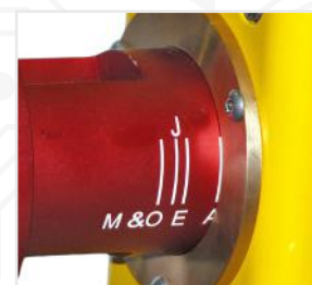
Adjustable interface to fit all headform sizes