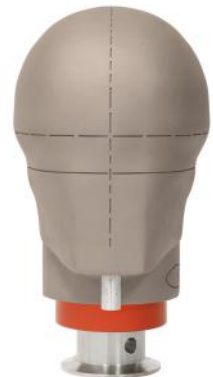
Optional quick release system - P/N: 300_08_UHSP