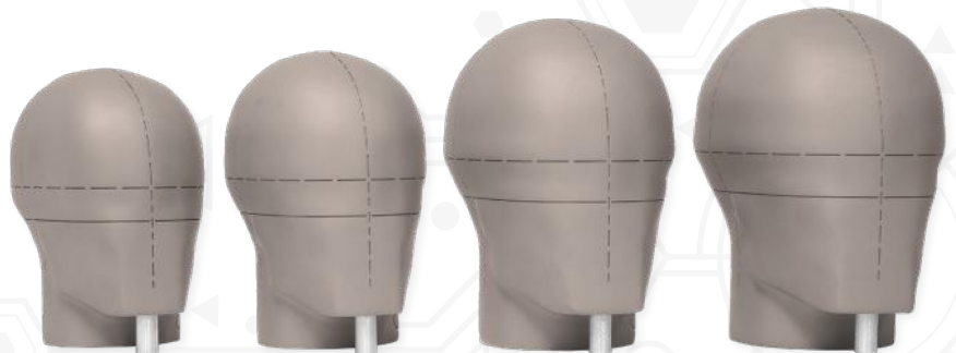
All standard sizes available