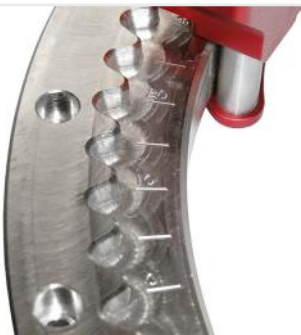
Angle positioning every 5° from 0° to 90°