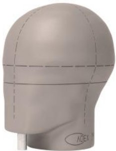
Compatible with conductive headforms*