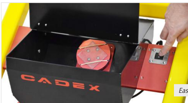
Easily accessible container