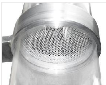
Sift of 1.6 mm mesh