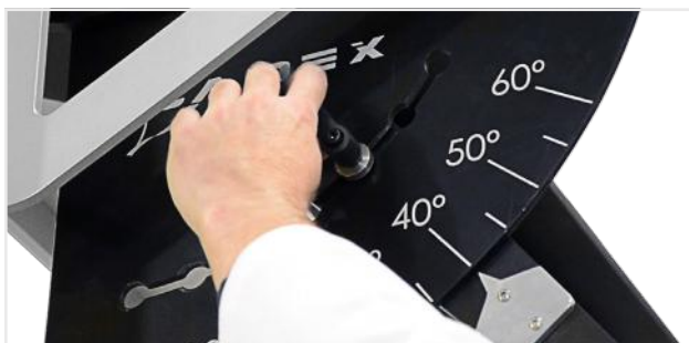
Fully adjustable angle preset